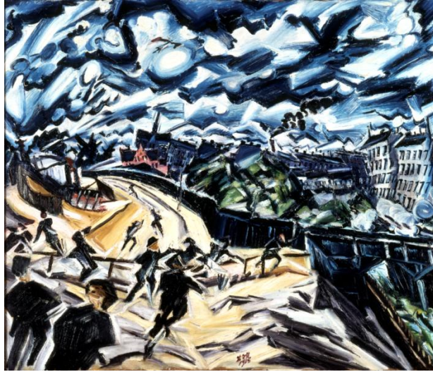
Ludwig Meidner (Germany, 1884–1966) , Apocalyptic Landscape , 1913, painting, oil on canvas, 37 1/2 x 31 5/8 in., gift of Clifford Odets (60.65.1b) LACMA

Compare and contrast this work of cinema with a German Expressionist work of art from LACMA's permanent collection, Apocalyptic Landscape by Ludwig Meidner (1913), pictured below. What compositional elements do you notice? What type of mood does the composition evoke? Describe the characters, action, and setting. If the characters were to speak, what would they say? If you were to title this painting, what title would you choose? What might have inspired Meidner to create this painting?